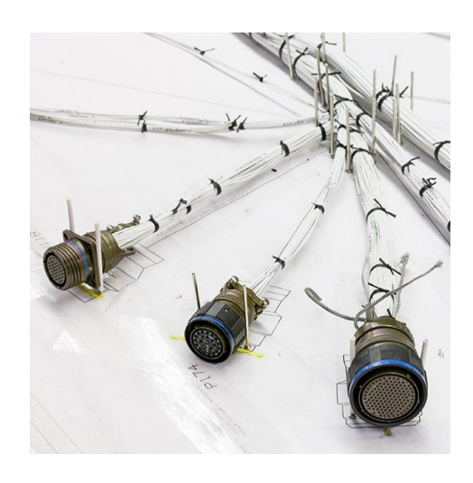
Contact: Amphenol Borisch Technologies borisch.com